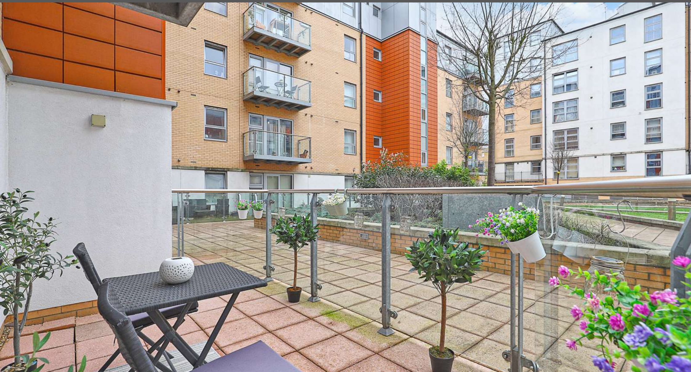
Gatekeepers House, Queen Mary Avenue, London

Guide Price: £420,000 - £440,000 Leasehold